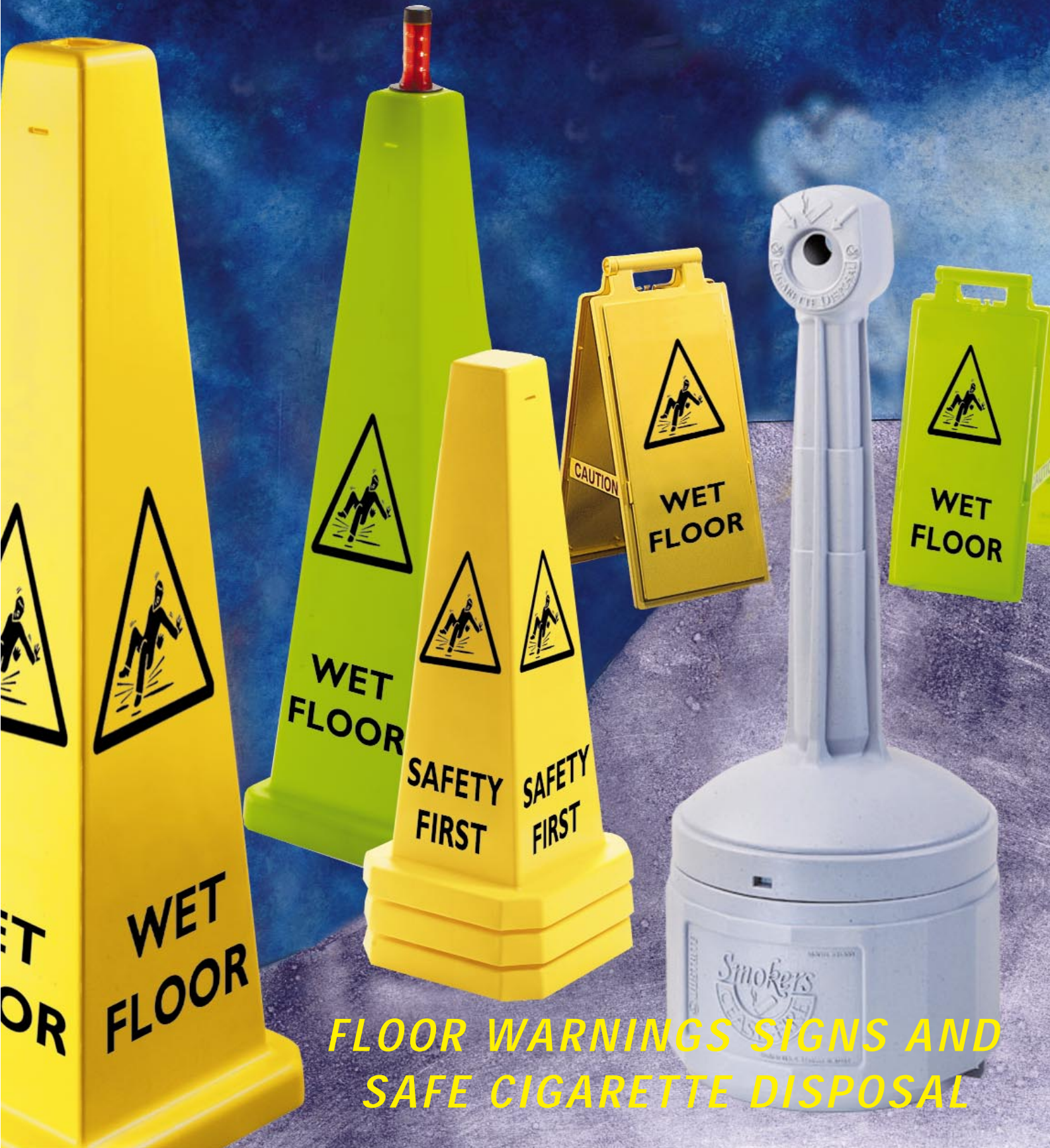
FLOOR WARNINGS SIGNS AND SAFE CIGARETTE DISPOSAL